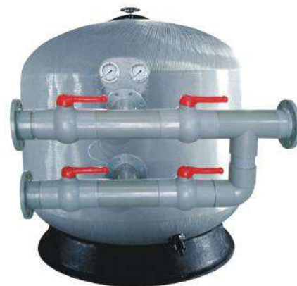
Manual control valve